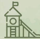
Kids' Play Arena